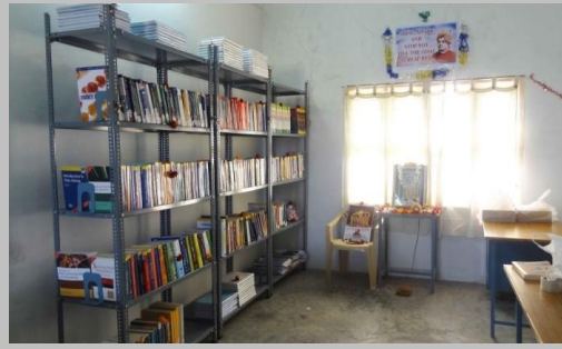
Books in Library