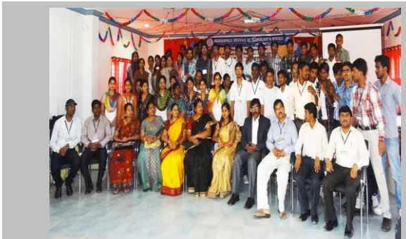
Group photo along with participants