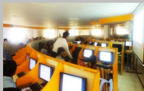
IBM TGMC Workshop