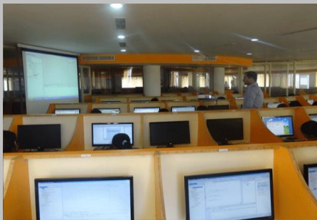
IBM RAD Workshop