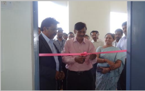
Inauguration of Department Library