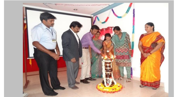
Inaugural function of GMOCS 2013