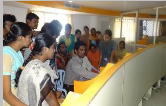
Alumni interaction with Students

"A good software engineer will tell you that a compiler and an interpreter are interchangeable"