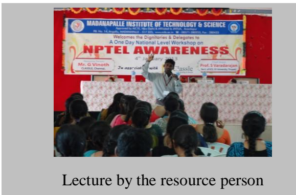
Lecture by the resource person