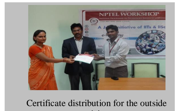
Certificate distribution for the outside